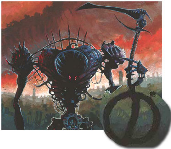
Left: Urza's Saga's Order of Yawgmoth