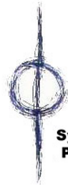
Symbol of Phyrexia

Yawgmoth's name and visage appear in several cards, but his symbol is more selective. Here are a few places you'll see the circle-and-vertical-bar symbol.